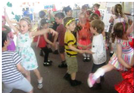
Reception Class holds an Ugly Bug Ball

We would love to welcome you to our Summer Fete and Dog Show from midday on Saturday 15th July. Come and see the Maypole Dancers perform. More details are available from the school office.